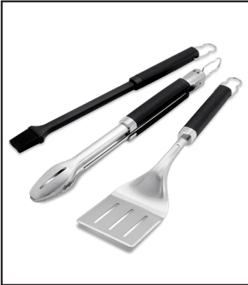
Precision tool set This premium set of tools, all with soft touch handle, includes a 3-sided beveled edge spatula, hands-free locking tongs and full-size silicone basting brush.