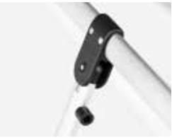
HIGH IMPACT RESIN JOINTS