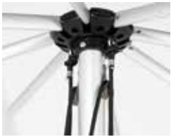
COMMERCIAL DOUBLE PULLEY SYSTEM