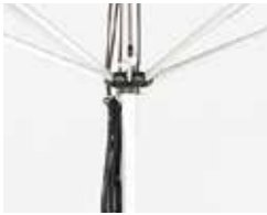
50mm DIAMETER POLE

Frames are made of Marine Grade Anodised Aluminium with a 3 year warranty against mechanical defects.