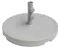
GREY CONCRETE BASE