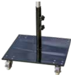
HEAVY BASE PLATE WITH WHEELS