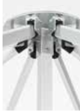
Telescoping Crank System