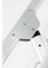
Double Reinforced Joints