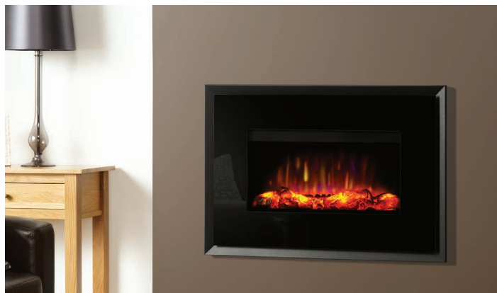
Evoke Black Glass Fascia