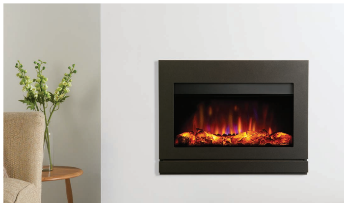
Designio2 Steel Fascia - Graphite