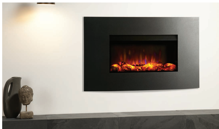
Verve XS Fascia - Graphite