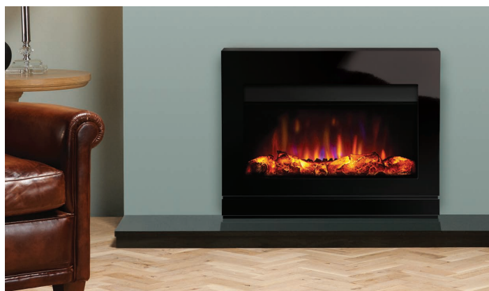
Designio2 Black Glass Fascia