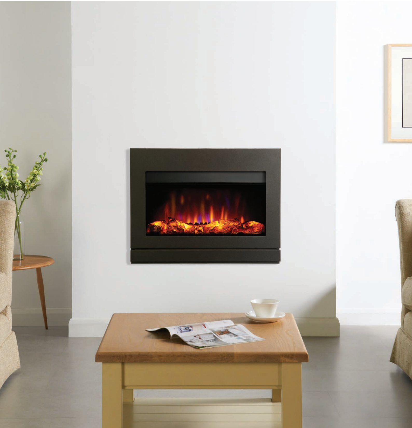
Riva2 670 Electric Designio2 Steel Fascia - Graphite