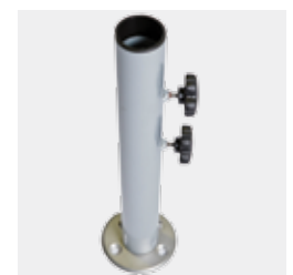
CAM-LOCK PLATE & SPIGOT