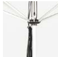
50mm DIAMETER POLE

Frames are made of Marine Grade Anodised Aluminium with a 3 year warranty against mechanical defects.