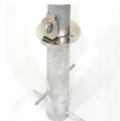
IN-GROUND SOCKET & SLEEVE KIT